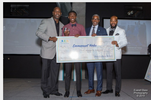
OAL Male Student Athlete of the Year and winner of a $7,500