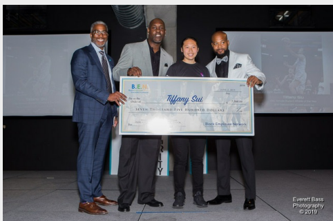
OAL Female Student Athlete of the Year and winner of a $7,500