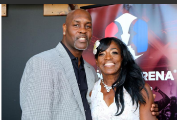
NBA and WNBA Hall of Fame backcourt, Gary Payton and Ruthie Bolton-Holyfield posing on the Red Carpet!